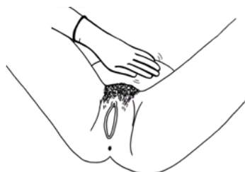
Massaging the uterus immediately after the placenta delivers 11

Countertraction (counter pressure): The action of lifting or elevating the uterus toward the mother's head during CCT to help prevent uterine inversion.